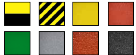
SAFE PLATE WALKWAY