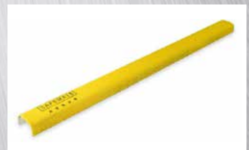
ANTISLIP LADDER RUNG COVER